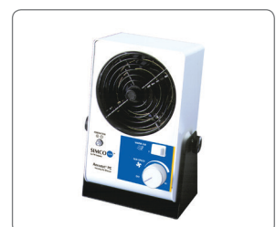
Aerostat PC Ionizing Air Blower