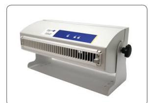
Aerostat XC2 Ionizing Air Blower