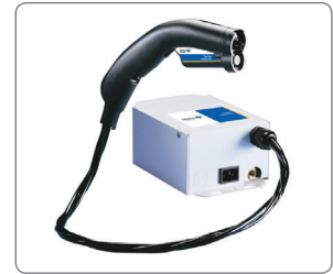
Top Gun Ionizing Air Gun