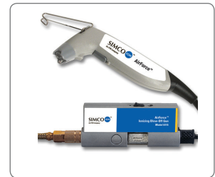
Model 6115 AirForce Blow-Off Gun