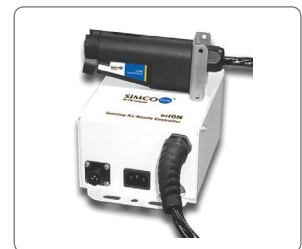
orION Ionizing Air Nozzle