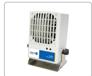
minION Ionizing Blower