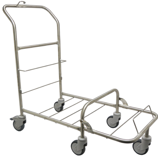
22-98 TruCLEAN Pro XL Cart