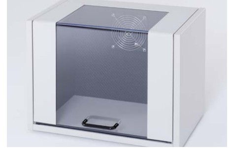
Noise protection box