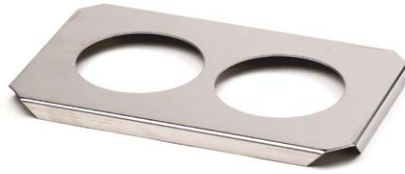
Perforated cover for using beakers