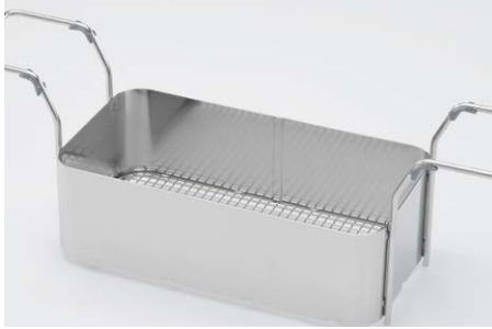
Baskets made of stainless steel