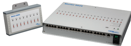
Model 5808, 5820 Ionizer Monitoring System