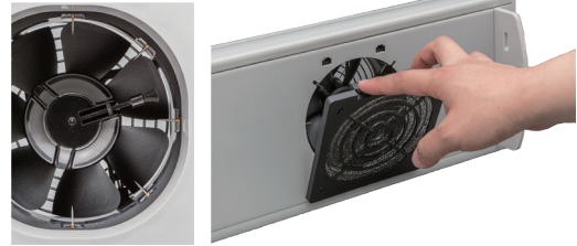
Auto-Cleaning Brush and Grille Opening