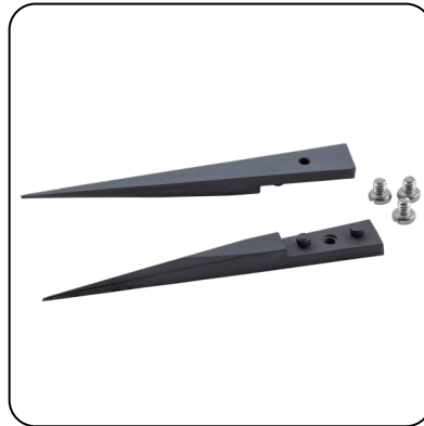
Replacement Tips Only: 73-ZJK-RT Kit of 2 Ceramic Tips and 3 screws

Unless otherwise noted, tolerance is \pm 10\% .