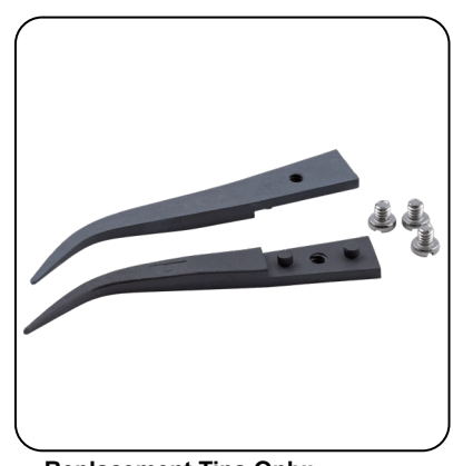
Replacement Tips Only: 7-ZJK-RT